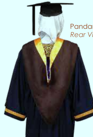
Pandangan Belakang Rear View