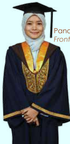
Pandangan Hadapan Front View