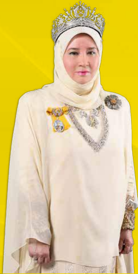
Kebawah Duli Yang Maha Mulia Seri Paduka Baginda Raja Permaisuri Agong Tunku Hajah Azidah Aminah Maimunah Iskandariah Binti Almarhum Al-Mutawakkil Alallah Sultan Iskandar Al-Haj

D.K., S.S.A.P., S.I.M.P., D.K.(Johor), S.P.M.J.